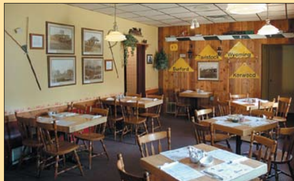
In the "Engine Room", you can rest your caboose and chew, chew, chew! This room's decor reflects the era of the iron horse.

Quehl's has become the destination for many motor coach tours, prior to and returning from, the Stratford Festival, being only 20 minutes from the Theatre. We have abundant facilities to accommodate a tour. We are an Eat Smart restaurant, Smoke